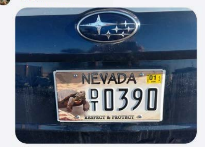
Like Reply Message 36m